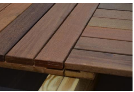
Panels in Mosaic Application